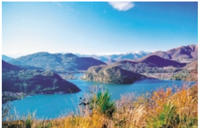
View of the Lake of Lugano and Caslano (7.2 km, 675 m)

In autumn, woodland footpaths can be covered with large quantities of vegetation.