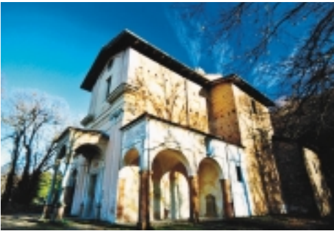
The Church of Madonna d'Ongero (4.6 km, 630 m)

Carona Church and convent of Santa Maria di Torello , Roman building with fragments of frescoes from XIII, private property; Sanctuary of the Madonna d'Ongero , constructed in XVII, decorations and plasterwork by A. Casella, frescoes by G. Petrini; Parish Church of San Giorgio , constructed in XVI, with bell tower from XVII, frescoes in the choir stalls by D. Pezzi ("The Day of Judgement"); Botanical gardens San Grato , with an area of 62,000 m; precious collection of azaleas, rhododendrons and conifers, 5 themed walks (botanic, relaxation, panoramic, artistic and tables) with learning panels.