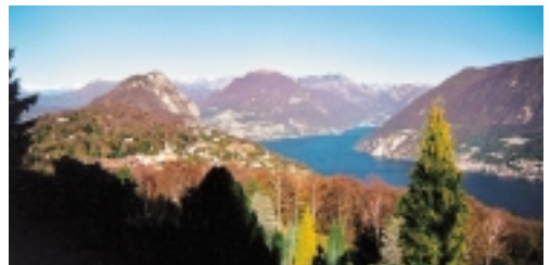
View of the lake from the San Grato gardens (1.3 km, 685 m)