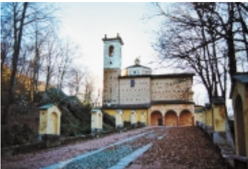
Avenue leading to Madonna d'Ongero (4.6 km, 630 m)