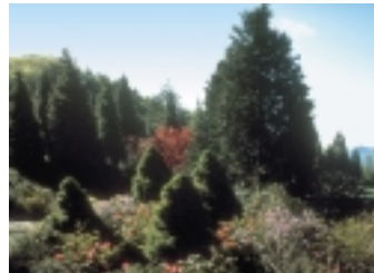
The botanical gardens San Grato, Carona