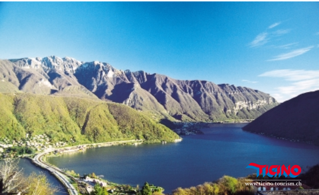
View of Melide, the Lake of Lugano and Monte Generoso (10,9 km, 625 m)